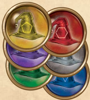
6 Character Tokens (2 Sided)