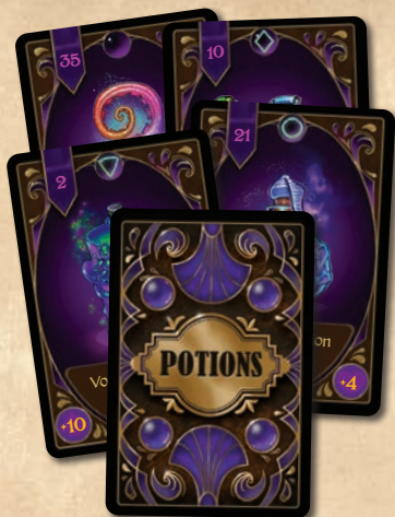
40 Potion Cards