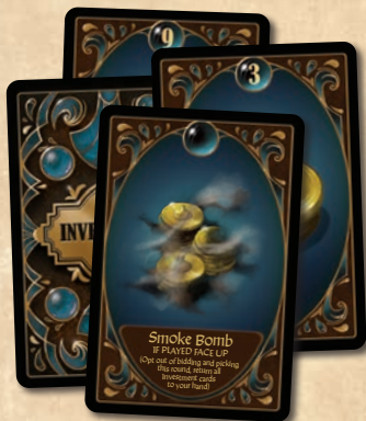
51 Investment Cards