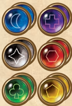
12 Color Tokens (2 of each color)