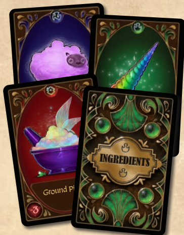
30 Ingredient Cards